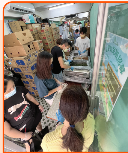
Food distribution with Rotaract Club of The University of Hong Kong 與香港大學學生會扶輪青年服務團參加食物派送