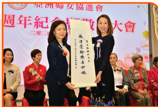
Donation to Asia Women's League Limited 捐贈給亞洲婦女協進會