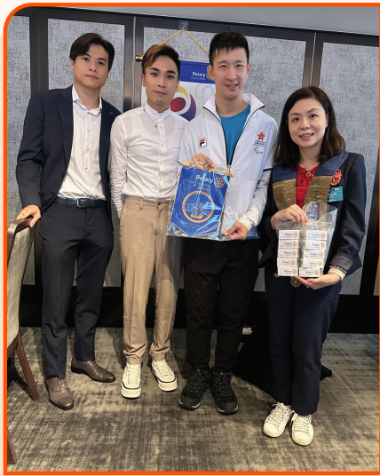
Donation of Oximeter to Paralympic 捐贈血氧計給殘奧運動會