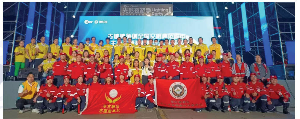
* The English name is for identification purpose only.

於二零二三年,為履行成為有社會責任企業之承諾,本 集團響應廣東省中山市的號召,組織本集團義工支援救 災及支援活動。於二零二三年三月,本集團義工參加中 山燈博會人員管控。於二零二三年七月,本集團義工參 與河南新鄉抗洪救災。