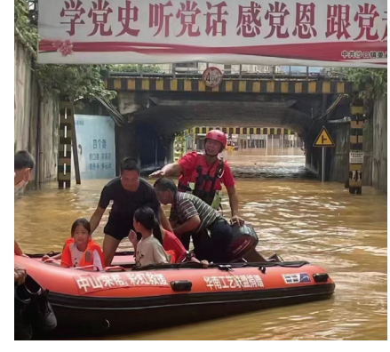
* The English name is for identification purpose only.