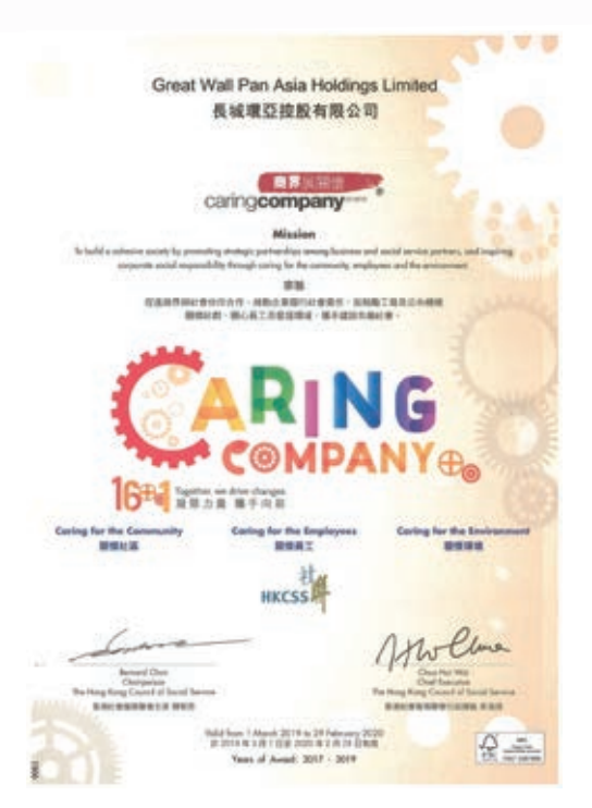
Caring Company Certificate 「商界展關懷」證書

經過多年來於社區投資的不懈努力,我們榮幸地 宣布我們再次獲得了由香港社會服務聯會頒發的 2019/20年度「商界展關懷」標誌。此標誌顯示了 我們積極履行社會責任的承諾,以及我們與慈善 組織長期合作的關係。