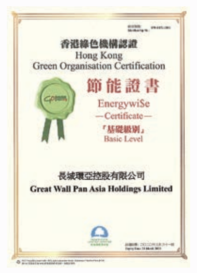
Energywi$e Certificate (Basic Level) 「節能證書(基礎級別)」