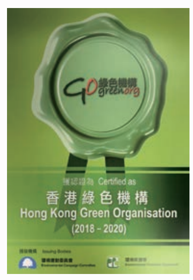
Hong Kong Green Organisation Certificate 「香港綠色機構」證書