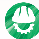
Suppliers and contractors 供應商及承包商