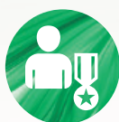
Employment and Labour Practices 僱傭及勞工常規