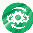
Operational Practices 營運慣例