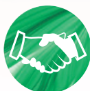
Shareholders and investors 股東及投資者