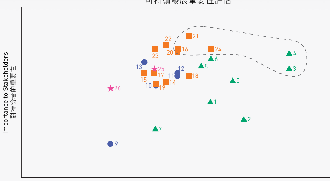
Importance to the Group's Development 對本集團發展的重要性