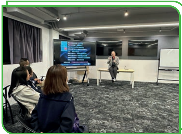
Figure 13: seminar supported by Get Nice (18 January 2024) 圖13：由結好支援的研討會 (二零二四年一月十八日)