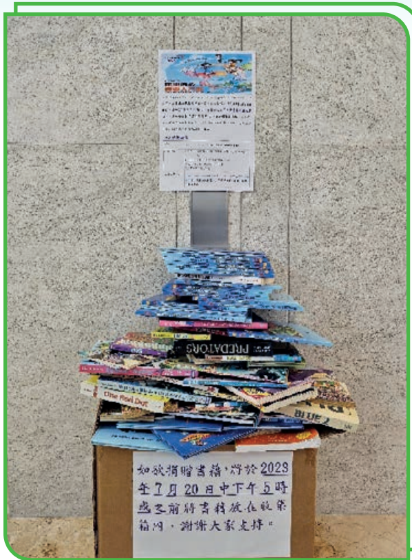
Figure 11: Used Book Recycling Campaign (July 2023) 圖11：舊書回收義賣大行動（二零二三年七月）

During the Reporting Period, the Group assisted “Rex ReAction” by helping to organise and facilitate five free-of-charge seminars focused on parenting skills and teenage care. Our employees volunteered their time and resources to contribute to the success of these seminars.