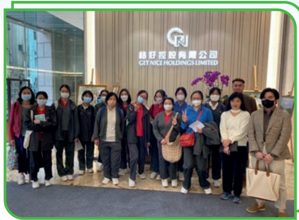
Figure 17: Career Oriented Program