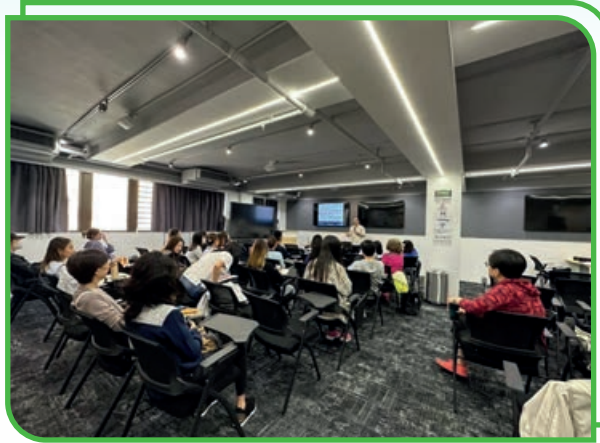
Figure 12: seminar supported by Get Nice (12 December 2023) 圖12：由結好支援的研討會 (二零二三年十二月十二日)