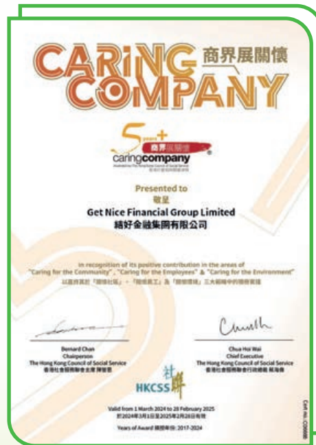
Figure 15: Caring Company Certification 圖15：「商界展關懷」證書