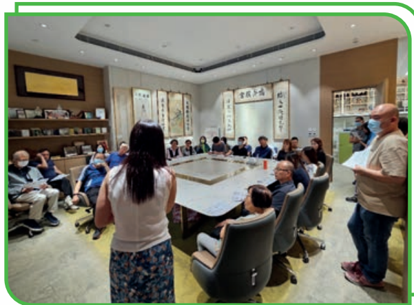
Figure 7: Chinese Medicine Dietetic Strategies Workshop (August 2023) 圖7：中醫健康飲食管理工作坊（二零二三年八月）

此外，本集團亦為僱員舉辦中醫健康飲食管理工作坊。工作坊邀請註冊中醫師介紹食療理論，包括四季養生及常見疾病的飲食調理。