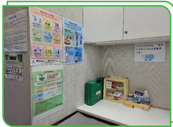
Figure 3: Virus prevention tips in the pantry 圖3：茶水間的防疫貼士