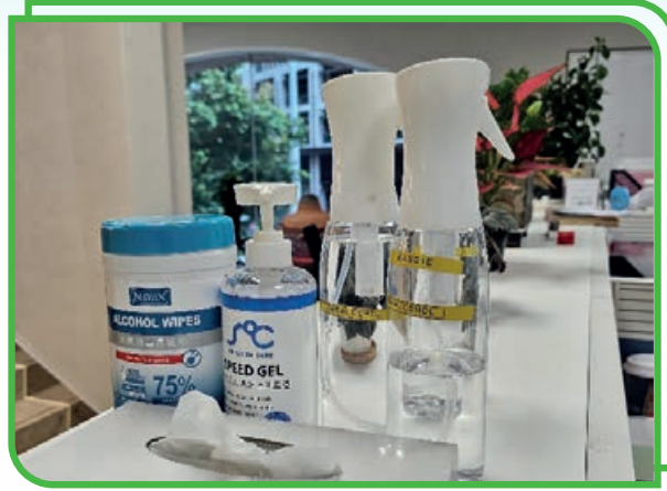
Figure 2: Alcohol wipes and hand sanitizer for employees and account executives 圖2：為僱員及經紀提供的酒精濕紙巾及搓手液

It is worth mentioning that the Group continued using multiple air purifiers and placed them in public areas on different floors for air sterilization and filtration.