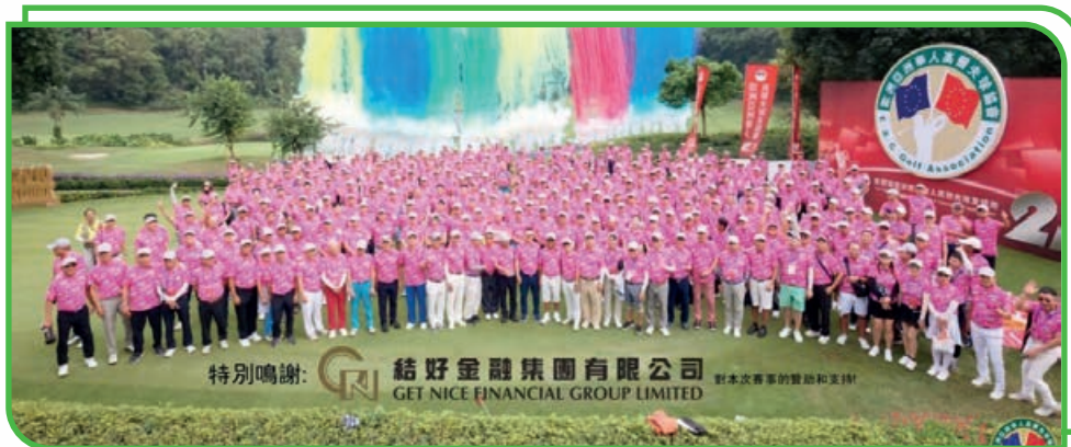
Figure 9: Special Acknowledgement by Euro Asia Chinese Golf Association 圖9：來自歐洲亞洲華人高爾夫球協會的特別鳴謝

捐款為支持社區發展的方式之一。於二零二三年九月，本集團向佛教(三角碼頭孟蘭勝會)慈善有限公司捐款港幣10,000元正、於二零二三年十一月，本集團向東華三院捐款港幣5,000元正及向十分關愛基金會捐款港幣20,000元正。於二零二四年三月，本集團向歐洲亞洲華人高爾夫球協會捐款港幣500,000元正。歐洲亞洲華人高爾夫球協會旨在團結華僑華人，增進歐亞華人對祖國發展的了解，讓僑領為祖國的公益事業和發展貢獻力量。