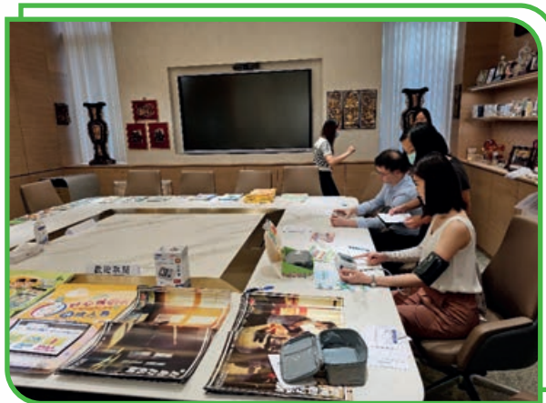
Figure 6: Staff participation in Health Day (August 2023)