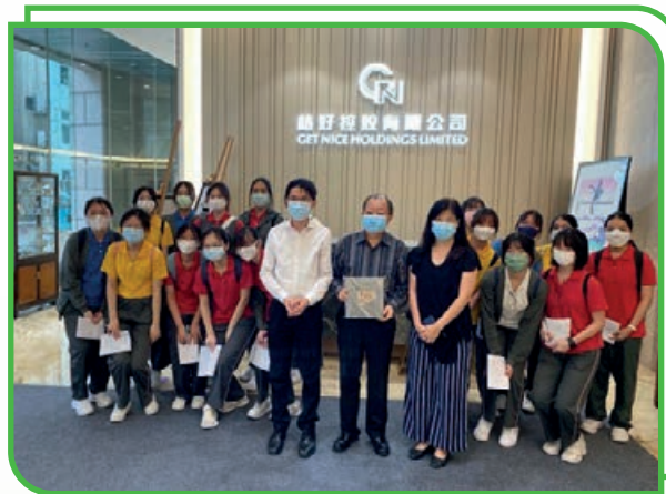
Figure 16: Career Oriented Program

本集團相信年輕一代是我們社會未來的棟樑。為了讓他們提前了解工作環境，本集團參與了「中學生及大專院校的職業導向培訓計劃」。該計劃為學生提供參觀本集團各個部門的機會。這些參觀活動讓學生得以更了解本集團的實際工作環境及日常營運。該等計劃培養並支持青年人才的發展。本集團期望激發學生的興趣，拓寬他們的視野，並鼓勵他們考慮日後在業內發展。