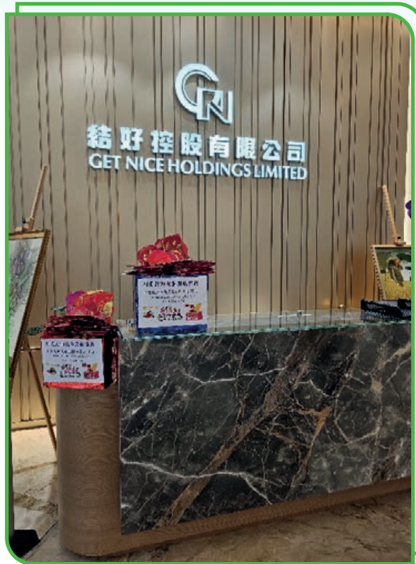
Figure 10: Used Lai-see packets donation boxes (February 2024) 圖10：已使用的利是封捐贈箱 (二零二四年二月)

Also, the Group participated in the Used Book Recycling Campaign 2023 held by World Vision Hong Kong. The used books gathered will be used for the local programs to support grassroots children with special educational needs.