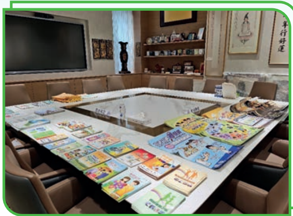
Figure 5: Information leaflet shared in Health Day (August 2023)