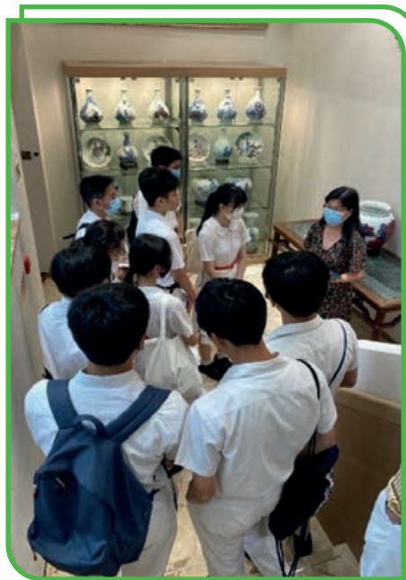
Figure 18: Career Oriented Program