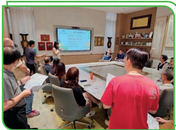
Figure 8: Chinese Medicine Dietetic Strategies Workshop (August 2023) 圖8：中醫健康飲食管理工作坊（二零二三年八月）