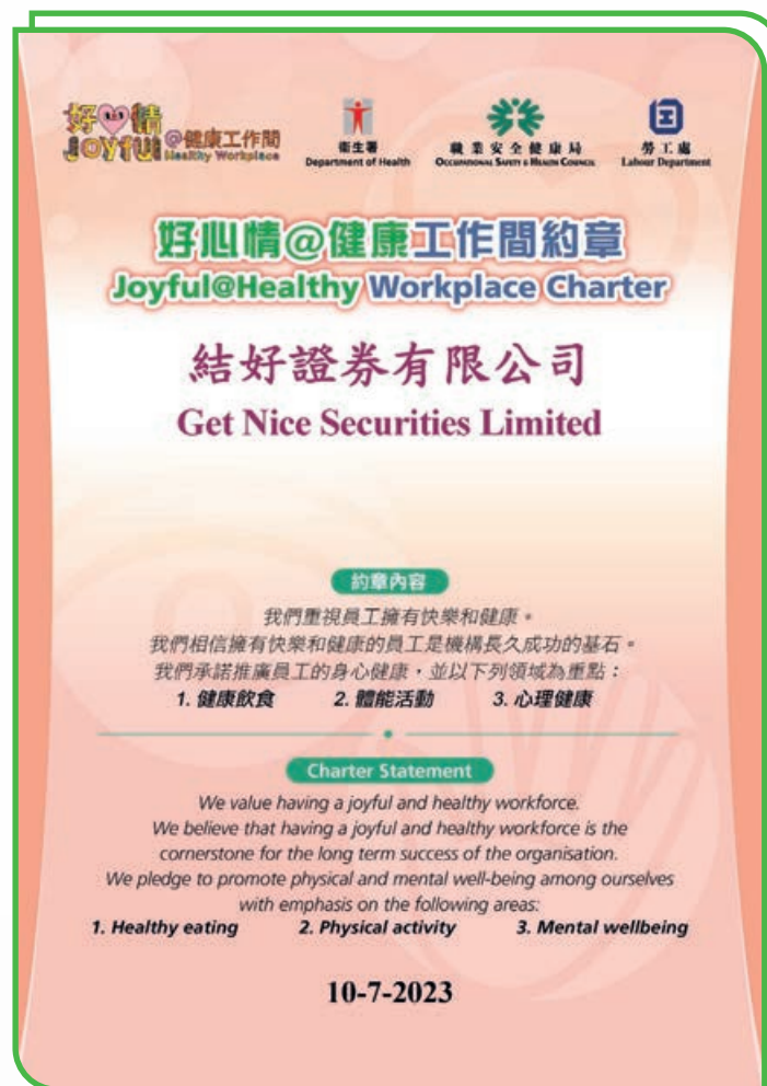
Figure 4: Joyful@Healthy Workshop Certification 圖4：好心情@健康工作間約章證書

本集團於報告期內參與好心情@健康工作間約章活動。作為活動的一部分，我們於本集團健康日期間，在會議室放置健康檢查包，供僱員監測及追蹤個人健康狀況。此外，僱員亦可獲得個人健康的宣傳單張及材料。