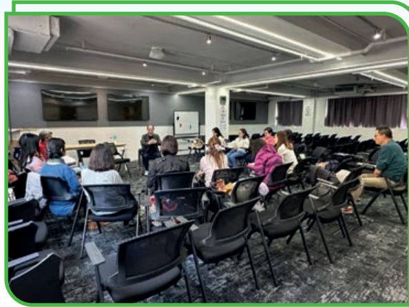
Figure 14: seminar supported by Get Nice (8 March 2024) 圖14：由結好支援的研討會（二零二四年三月八日）

Our contribution to the community was recognised by the Hong Kong Council of Social Service and was awarded the Caring Company Logo for seven consecutive years.