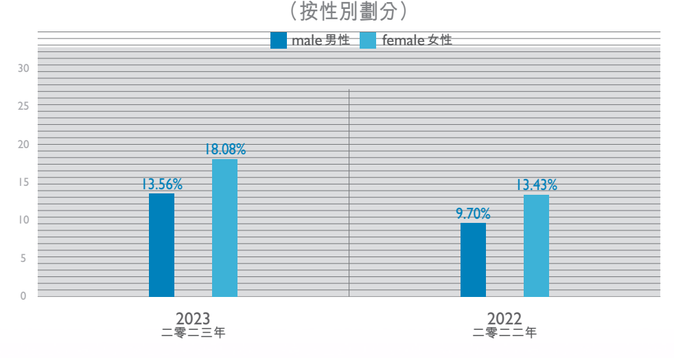
THE EMPLOYEE TURNOVER RATE OF 2023 AND 2022 (BY GENDER) 二零二三年及二零二二年僱員流動率

本集團的僱員流動率於二零二三年為 31.64%,較二零二二年的23.13%上升 8.51%。流動率上升主要是由於集團於 二零二三年採取措施進行部門和架構重 組,較多不適用的人員自然流失或被新 僱用的人員取代。