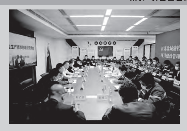
Case: On-Site Meeting of Safety Production Standardization Construction 案例: 安全生產標準化建設現場會