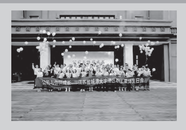
Case: Group birthday party activity 案例:集體生日會活動