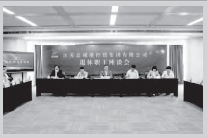
Example: Held a symposium for retired employees 案例:召開退休員工座談會

On the eve of the Chung Yeung Festival, in order to spread the tradition of respecting the elderly, the Group held a symposium for retired employees in October 2023, and the Group leaders participated and delivered speeches. During the meeting, the retired employees watched the promotional video together, and the representatives of the outstanding retired employees were awarded souvenirs and exchanged speeches.